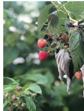
Raspberries for All – Help Yourself to these Sweet Treats!